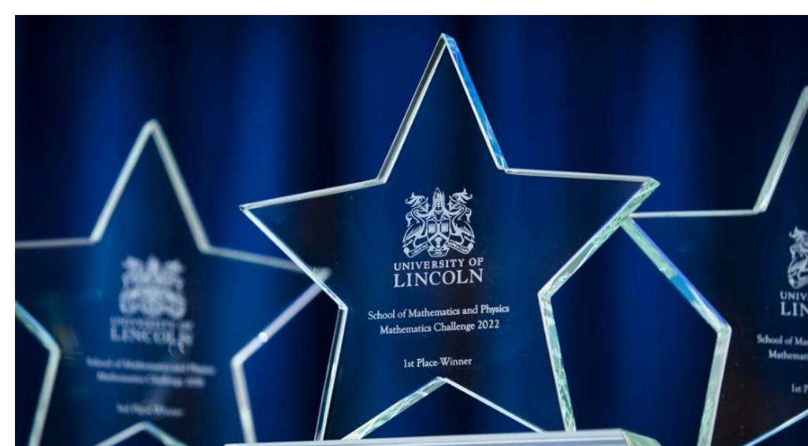
Trophies for winners of Lincoln Mathematics Challenge

Staff of the Algebra Centre conduct extensive outreach activities aimed at raising the public awareness of the importance and beauty of mathematics, attracting school children to studying mathematics at all levels, changing the perception of mathematics and mathematicians in the society. They organize every year Lincoln Mathematics Challenges, masterclass lectures and workshops for school children, as well as public lectures for the general public.